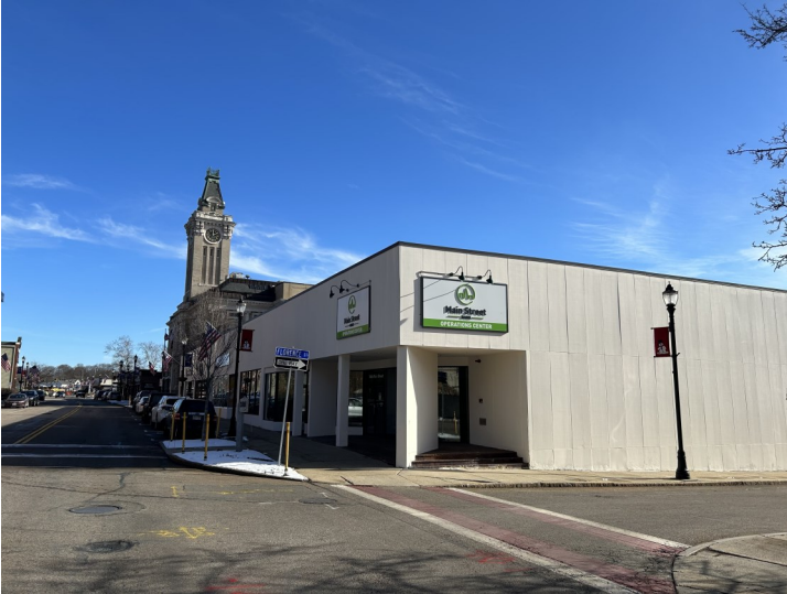
Corner of Main St. & Florence St.