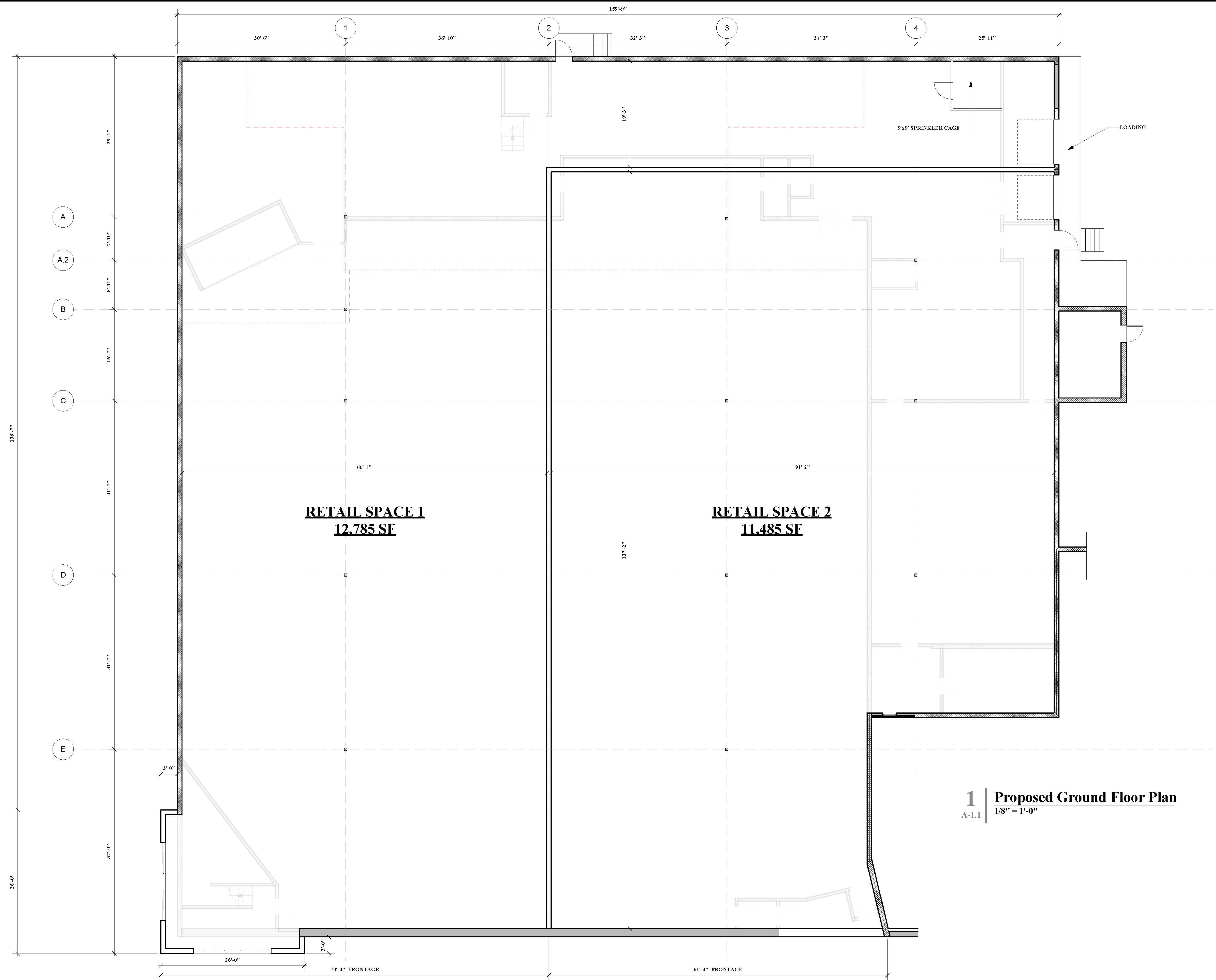
1 Proposed Ground Floor Plan A-1.1 1/8" = 1'-0"